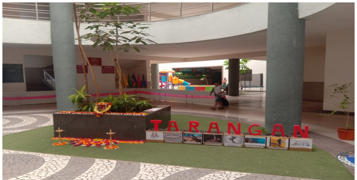
Beautiful Decoration of 'Tarangan-2023' at VPKBIET, Baramati

The Grand Event, i.e., Vidya Pratishthan's 'Tarangan-2023' was organised during 3 and 4 March 2023 in VPKBIET Campus. In this event following competitions were planned on 3 March 2023: 1. Short film Making Competition, 2. Code-a-thon, 3. On the spot poster making competition, 4. Technical Project Competition, 5. Dance Competition and 6. Personality Contest. The exclusive Interview of Hon. Sharadchandraji Pawar Saheb was conducted by our students on 4 March 2023. In the above various competitions, around 240 IT students participated.