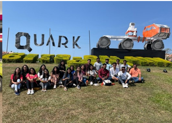
The Students during the Event