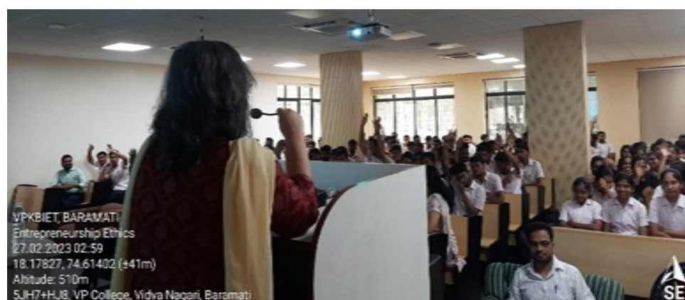
The Faculty and Students during the Program