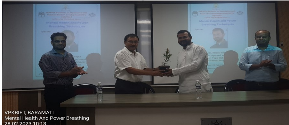
Felicitation of Guest during the Program