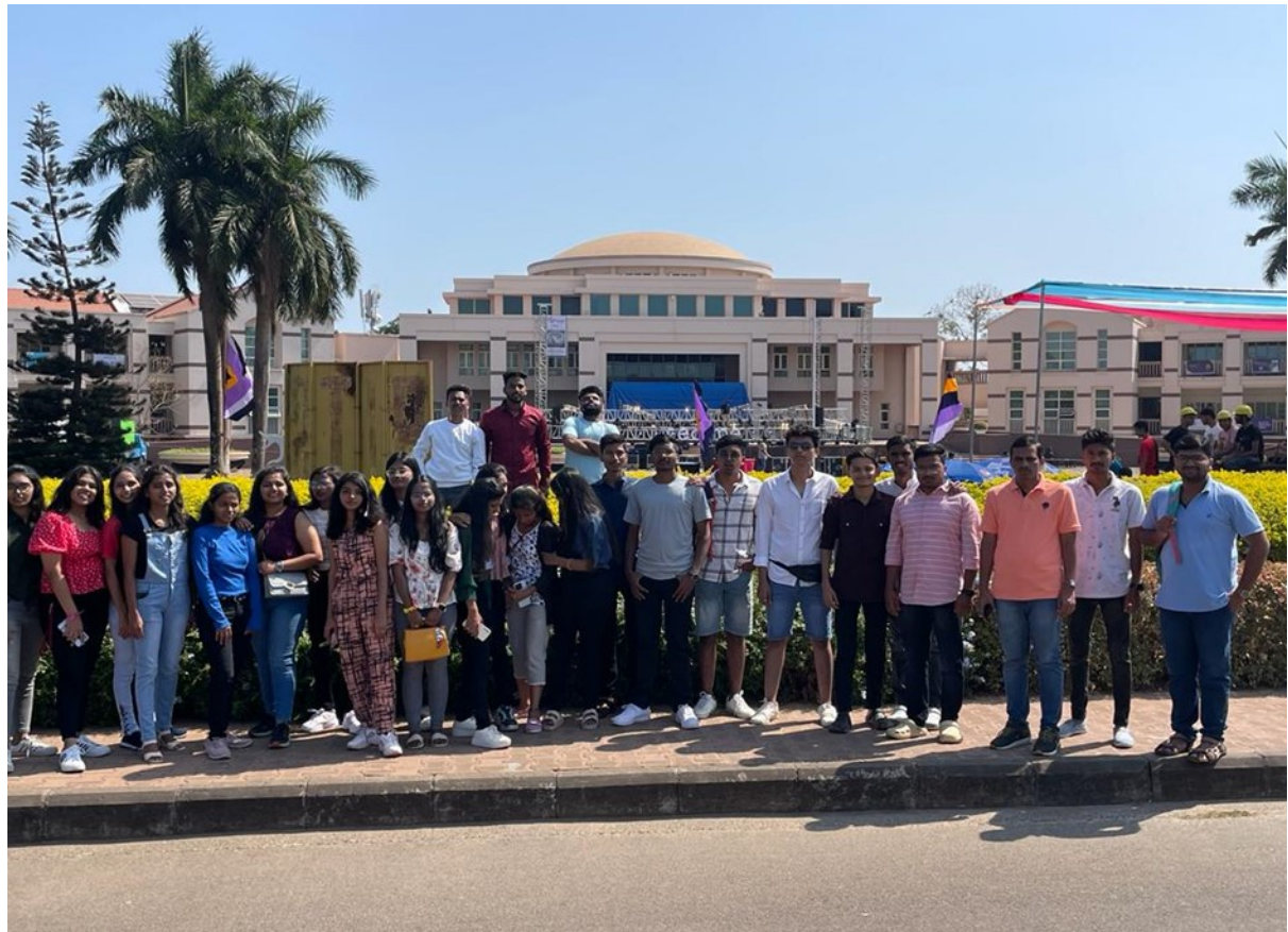
The Faculty and Students during the Event