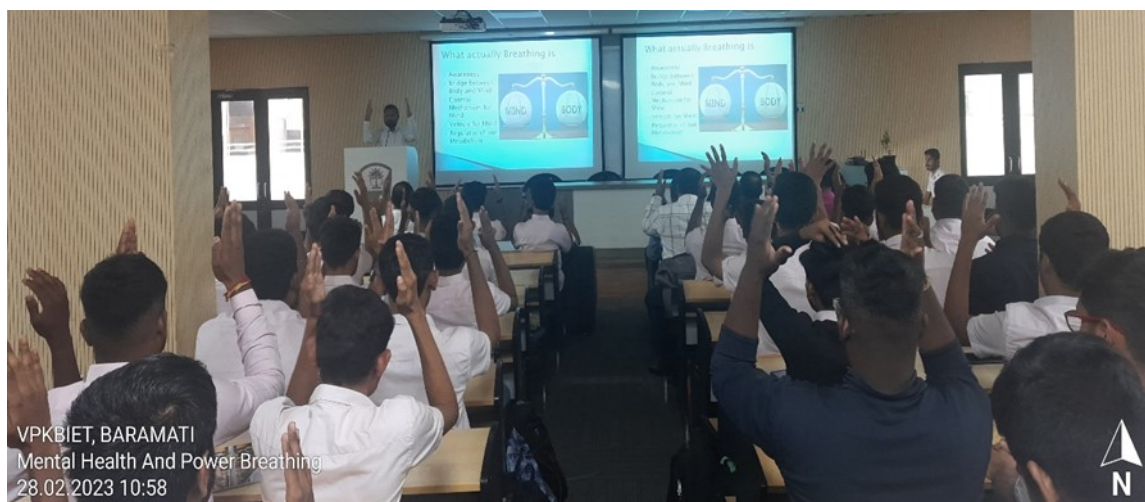
Students during the Session on Mental Health Care

Vidya Pratishthan's KBIET, Baramati organized an event 'SRARC (Student Pune Air Conditioning and Refrigeration Conference)' on 11 February 2023. The program was organised in collaboration with ASHRAE Pune Chapter. This conference was sponsored by ASHRAE Pune Chapter. The students and Faculty from different institutes under Pune Chapter participated in this event.