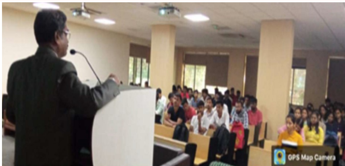
Students during the session on Professional Ethics and Personality Development