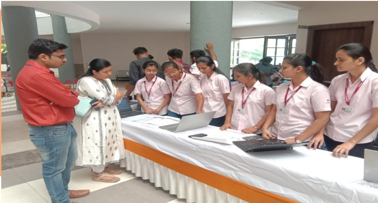
Participating Students in 'Tarangan-2023'